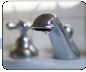
Better in the bathroom.