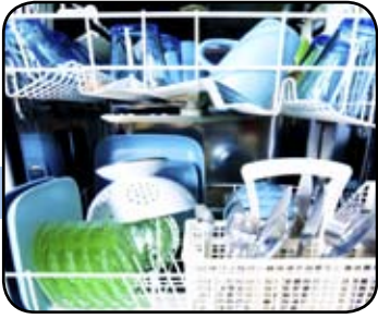
Better in the kitchen.