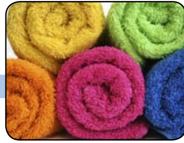
Better in the laundry.