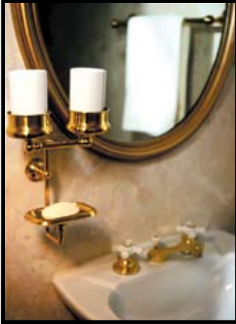
In the bathroom . . .

Enjoy Softened Water Throughout Your Home