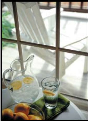
In the kitchen . . .

Economical Water Conditioning System SAVES You Money!