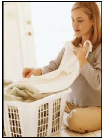
In the laundry . . .