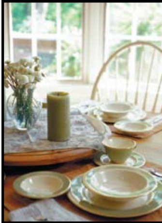
In the kitchen . . .

Economical Water Softening System SAVES You Money!