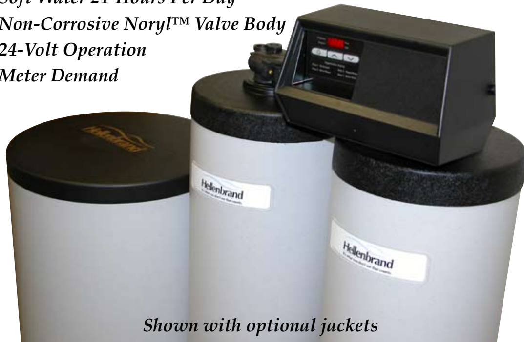
Shown with optional jackets