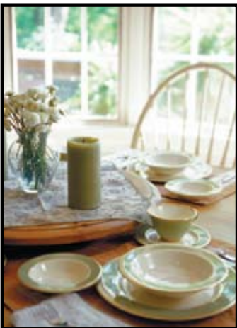
In the kitchen . . .

Economical Water Conditioning System SAVES You Money!