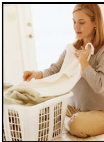
In the laundry . . .