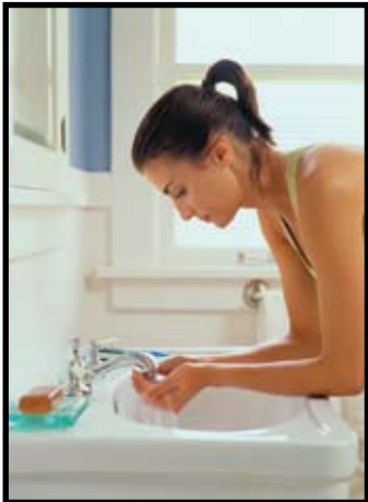
In the bathroom . . .

Enjoy Softened Water Throughout Your Home