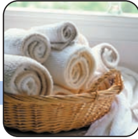
Better in the laundry.