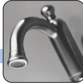
Better from the faucet.