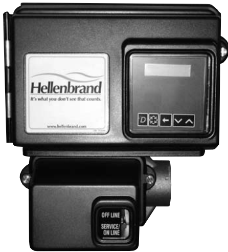
TN2 “NXT” Microprocessor System