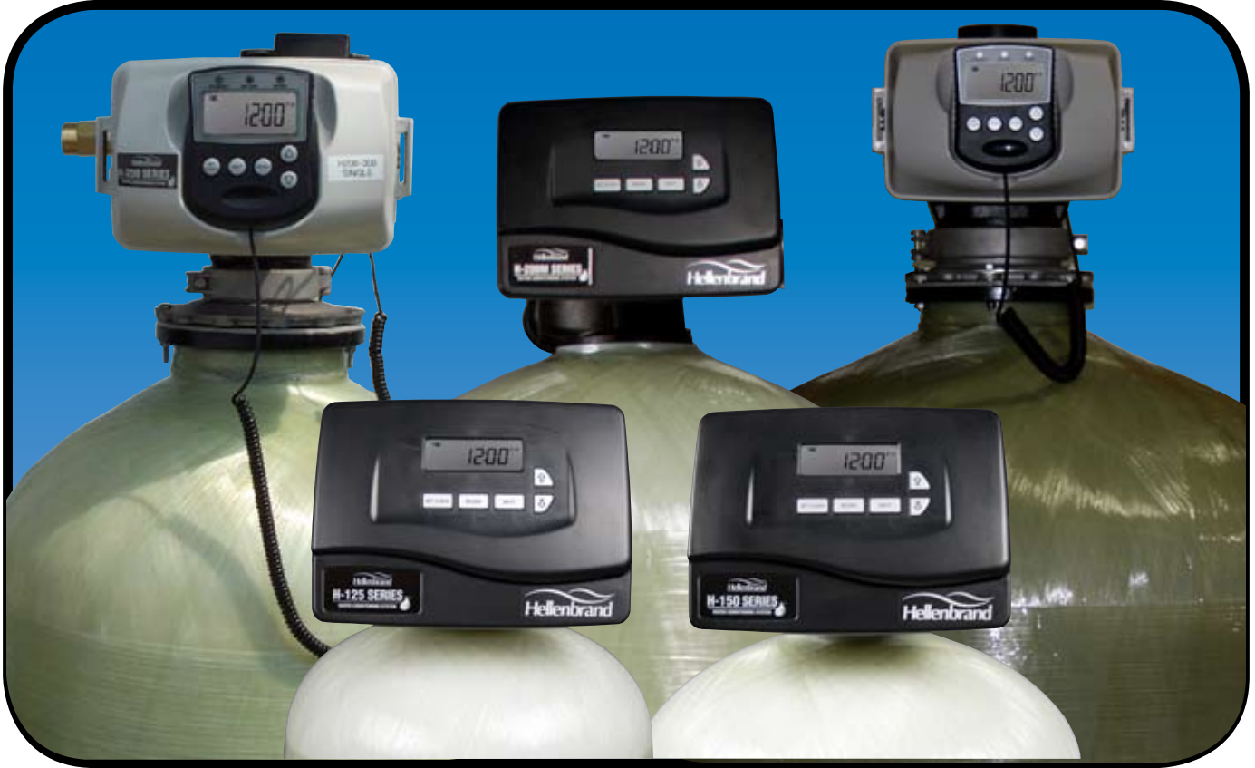
The H-Series Family H125, H150, H200, H200M, H300