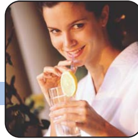
Better from the faucet.