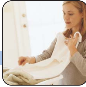
Better in the laundry.