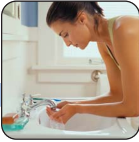
Better in the bath.